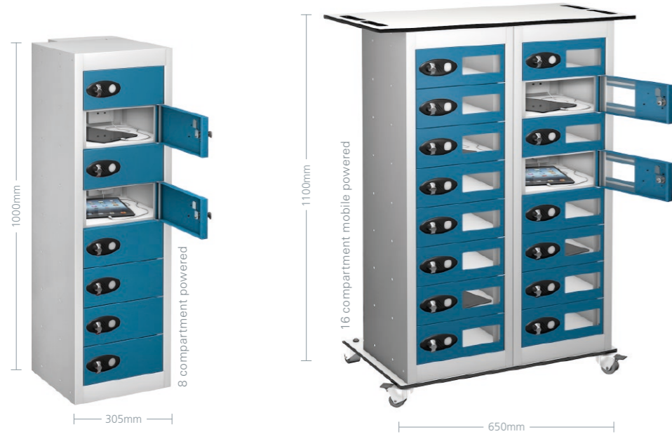
Charging External Depth 370mm

charge and store smaller devices such as phones, tablets, body cams etc.